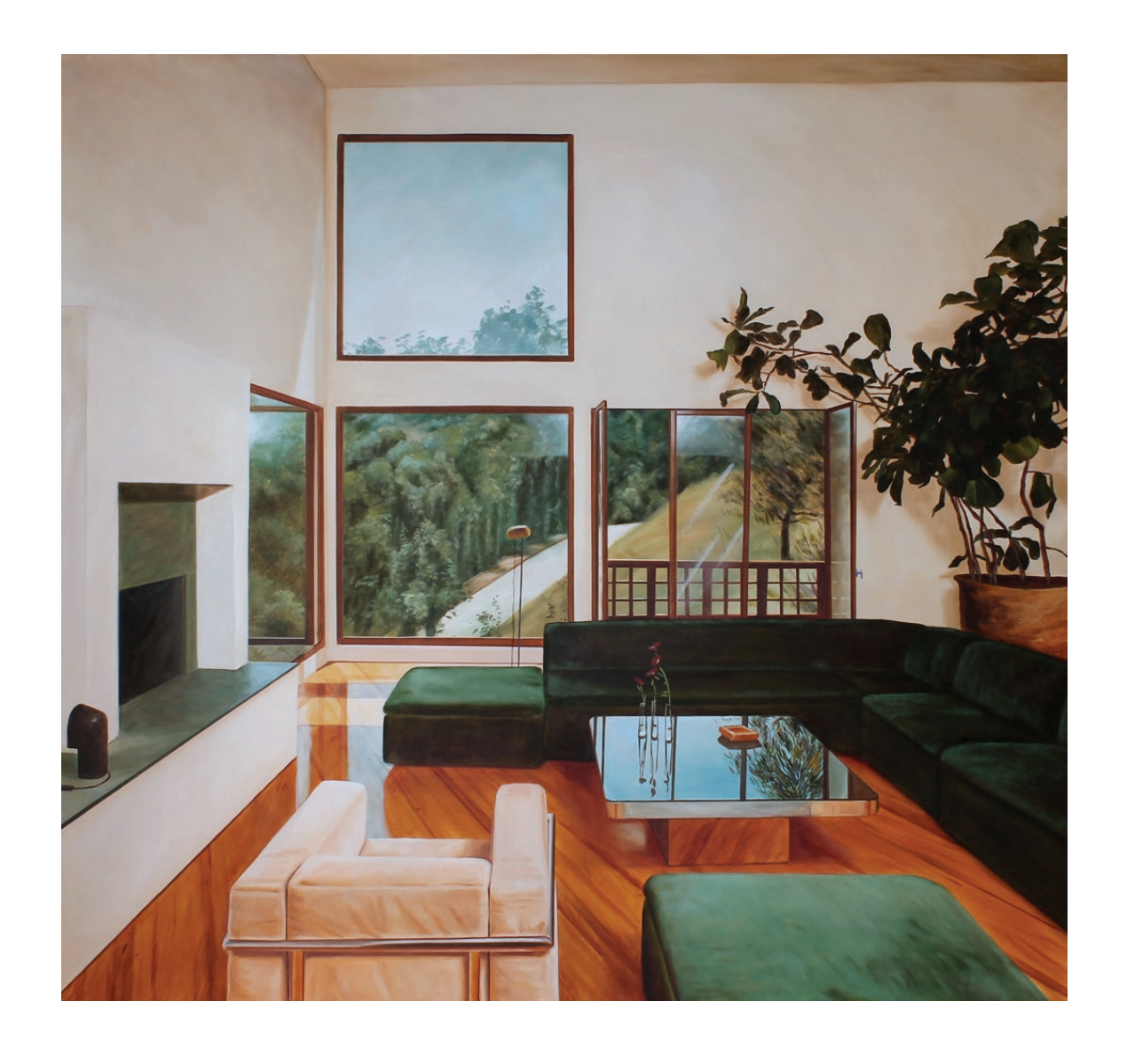
Brian Rideout American Collection Painting 35 (The Vista), 2019 Oil on canvas 56 x 60 in.